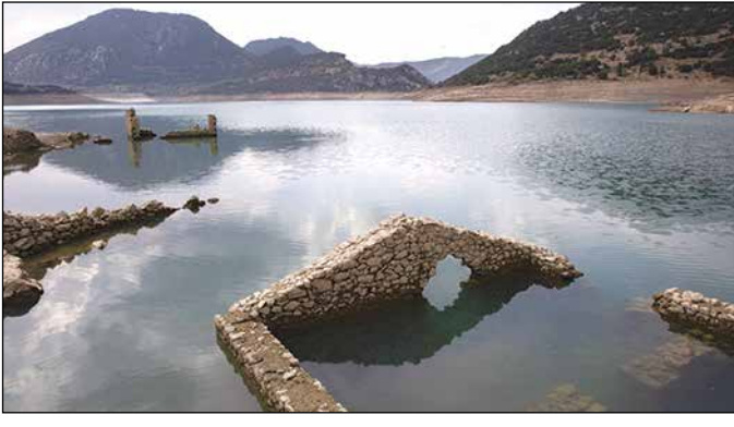
Receding waters at Mornos Lake, reveal the ruins of old town Kallio, submerged in the late 1970s to create a reservoir to meet the needs of the population of Athens

As the tourism-reliant country sees record numbers of foreign arrivals — and a summer spike in water consumption — some parts of