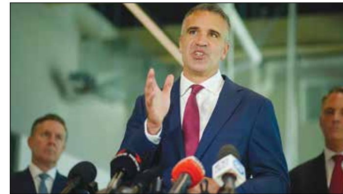
South Australian Premier Peter Malinauskas

and development. The 276-page report includes a proposed bill which sets out the legislative framework to ban social media for children under 14 and require social media companies to establish parental consent before allowing children aged 14 and 15 to use their platforms